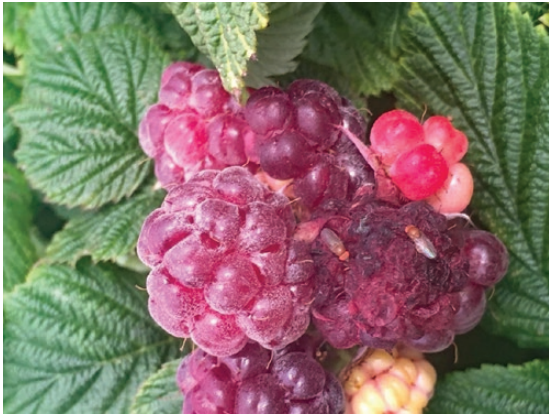
Fig. 2. Spotted wing Drosophila adults on raspberry with drupelets damaged by larval feeding; within hours, fruit degrades, and becomes unmarketable (S. Wold-Burkness, University of Minnesota).