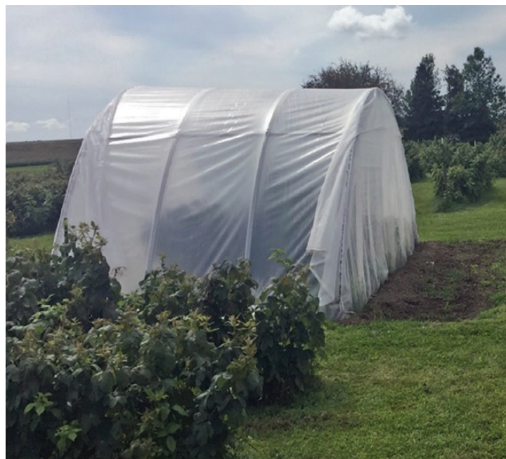
Fig. 4. Experimental high tunnel covered with standard poly, and fine mesh exclusion netting on each end (E.C. Burkness, University of Minnesota).

planted acreage among those surveyed with a median yield loss of 20% in 2017 (Table 4). This occurred despite 74% of growers actively managing to control spotted wing Drosophila . Controls included conventional, nonorganic pesticides; organic biocontrols; sanitation; physical exclusion and mass trapping. Median reported MN yield losses are well below initial spotted wing Drosophila -induced raspberry yield loss estimates of 50% in California that were observed prior to implementation of spotted wing Drosophila management controls. Following the introduction of effective spotted wing Drosophila chemical controls, on-farm trapping in CA suggested that nonorganic raspberry yield losses fell from 10% in 2011 to less than 1% during 2012. At the same time, however, organic raspberry growers in CA experienced consistent annual yield losses of 12% during 2011–2012 due to ineffective spotted wing Drosophila control measures (Farnsworth et al. 2017). The relatively high spotted wing Drosophila -related yield losses reported by MN growers (compared to yield losses reported by CA growers) may be explained by the later detection of spotted wing Drosophila in Minnesota and the use of less aggressive spotted wing Drosophila controls by MN growers.