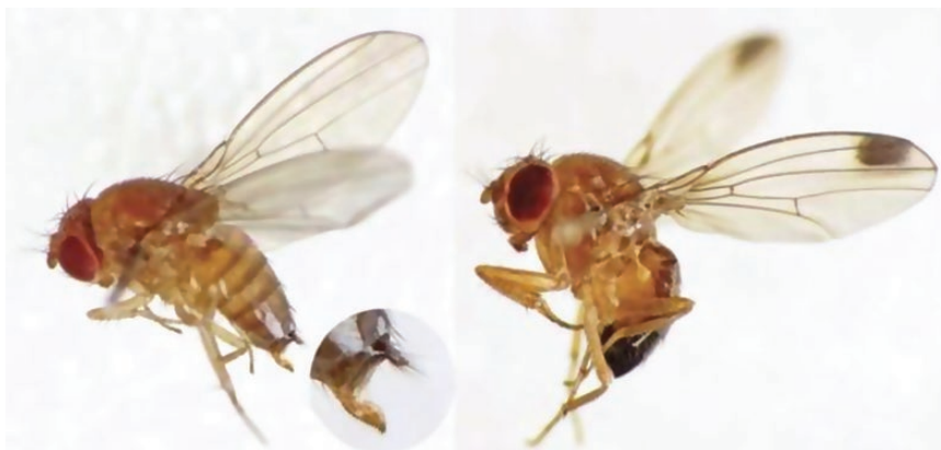
Fig. 1. Spotted wing Drosophila female (left), with serrated ovipositor highlighted; male (right), with distinctive spots on wings (C. Guedot, University of Wisconsin-Extension).

The results of the e-survey indicate that raspberry growers have borne the highest levels of infestation among Minnesota fruit growers surveyed. Raspberry yield losses attributed specifically to spotted wing Drosophila infestation ranged from 2 to 100% of